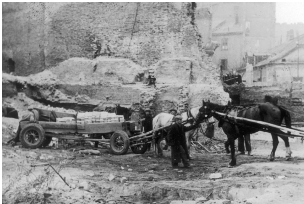
Fig. 2 - Brick salvaging in the ruins of the central Warsaw, 1948.

that had been salvaged ( Przegląd Budowlany , 1948). Importantly, these data take no account of bricks obtainable with no market transaction needed, given the possibilities of theft or appropriation in the absence of inhabitants or owners for many a ruined building. The comparison of prices set by the dynamic local market was a crucial way in which employees of the reconstruction administration assessed the “rationality” of the specific material or construction technology in the immediate postwar period. However, many of them were also involved in the development of a planned economy and socialist politics in Poland. They therefore sought to depart from market price as the sole indicator of a rational and economically justified decision – a perspective associated at the time with decision-making under a capitalist economy. They searched for other indicators which would allow reconstruction materials to be assessed, such as: “[...] the amount of coal or oil needed to produce a given building material,” as well as “the use of waste materials” in their production (Nechay, 1947: 35).