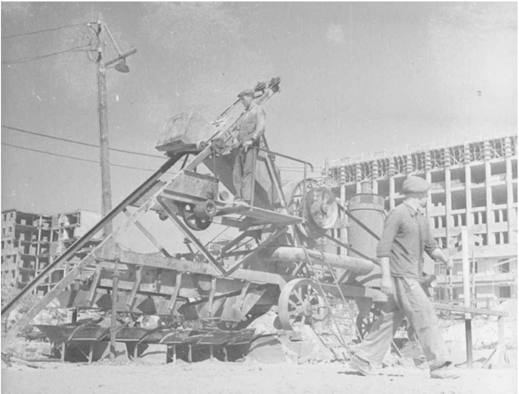
Fig. 6 - Rubble crusher and sorter in operation in central Warsaw, 1948. It is one part of the larger mechanical assembly producing air bricks, eighteen of which were acquired in Switzerland in 1946.

rogated if a look is taken at the transactions allowing coal-conserving rubble recycling to be pursued in the context of Warsaw's reconstruction.